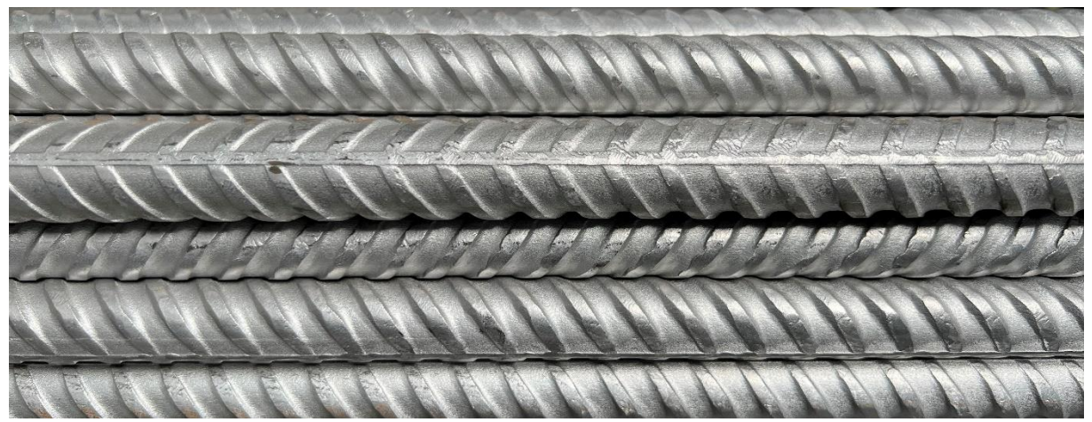
Figure 1 Hot-rolled steel picture

According to EN 10088-1 the classification of stainless steel is a minimum content of 10.5% chrome and maximum 1.2% carbon. Stainless steel alloys, used for reinforcement often have a higher content of chrome, as well as addition of nickel and maybe molybdenum to increase the corrosion resistance further.